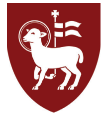
The Honourable Society of the Middle Temple